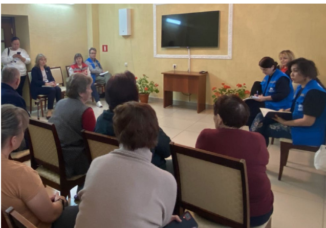
UNHCR and the Russian Red Cross meeting with Ukrainian refugees in Ulyanovsk