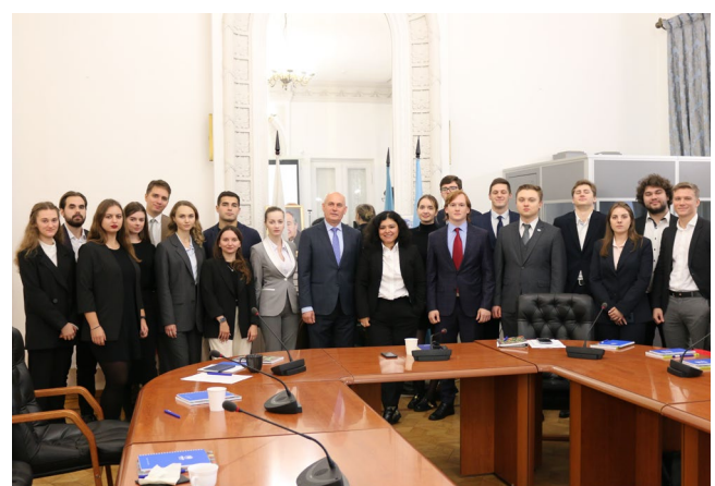
Lecture on refugee protection principles for students of the Diplomatic Academy