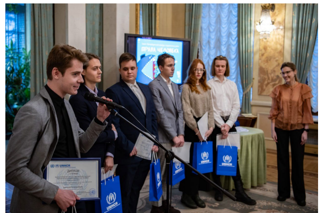
Ceremony of awarding diplomas to student participants of a human rights contest