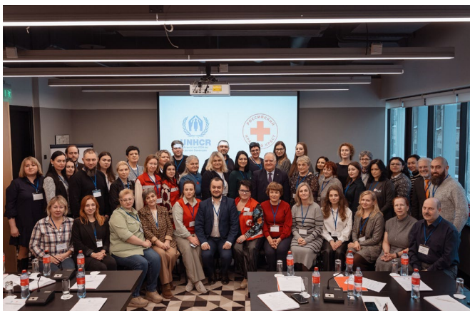
Participants of UNHCR's seminar for Russian Red Cross