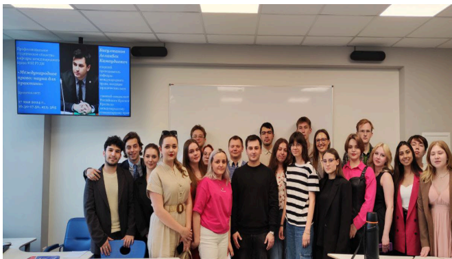
Award ceremony of the winners of student research contest on refugee topics at RUDN University