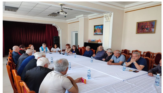
UNHCR and its partners' participatory assessment meeting with forcibly displaced persons from Karabakh in Pyatigorsk, Stavropol Krai