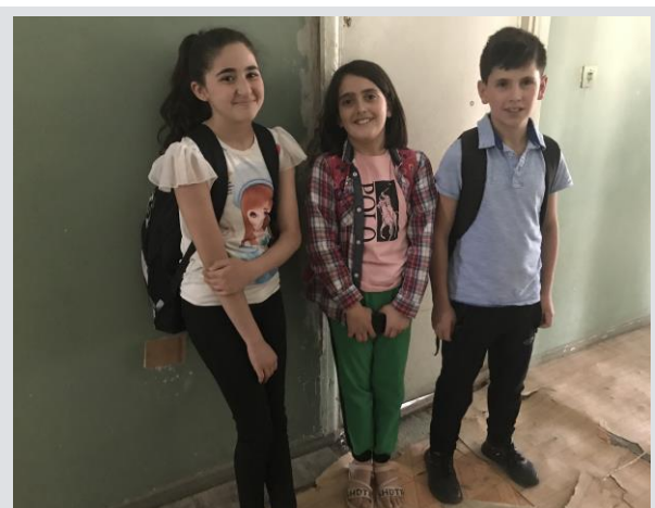
Schoolchildren from displaced families from NK

have been launched through Armenia. Two municipalities and five community-based organizations were provided with technical assistance in Syunik province. Construction of two sport courts with children's playgrounds was launched in Sisian and Goris towns.