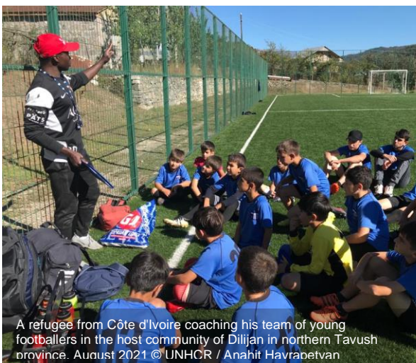
A refugee from Côte d'Ivoire coaching his team of young footballers in the host community of Dillijan in northern Tavush province. August 2021