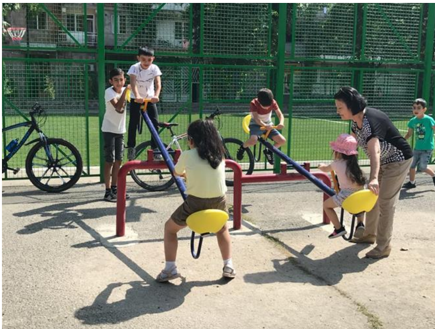
Children displaced by the NK Conflict play with local children on their new playground constructed by UNHCR. Goris, Syunik Province, September 2021

UNHCR and partners are working toward enhancing the protection environment while providing assistance to those most at risk. UNHCR continues advocating for inclusion of persons of concern in national response plans, including COVID-19 recovery and vaccination plans and other legislative and administrative reforms.