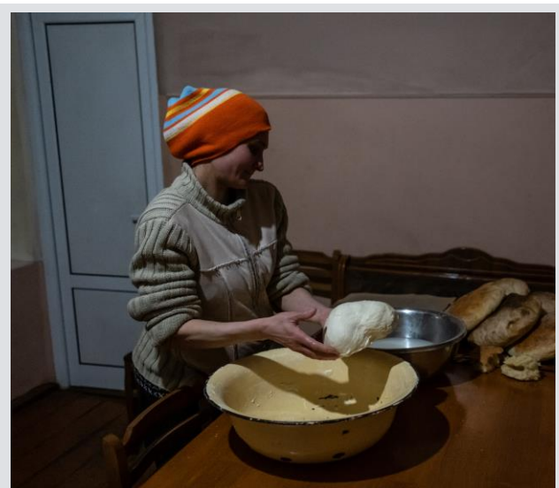
A displaced woman bakes bread for her large, multi-generational family in Getahovit village near Ijevan, Tavush Province, Armenia, February 2022.

UNHCR continues operation of a hotline to ensure consistent communication and a feedback mechanism with persons of concern. Between September 2021 and January 2022, the hotline received 1,317 calls from persons of concern.