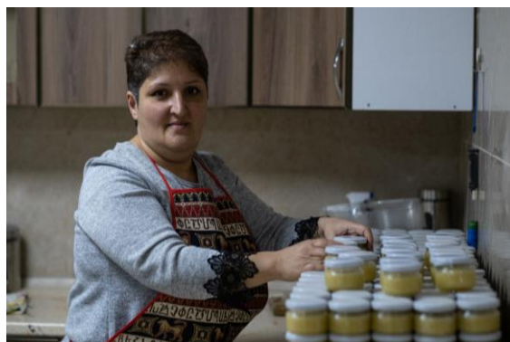
Women's Resource Centre NGO has engaged in a full-fledged social entrepreneurship thanks to UNHCR's capacity-building activities in host communities. Berd town, Tavush province.

participated in group psychological sessions implemented by UNHCR partner, Armenian Red Cross Society during the reporting period.