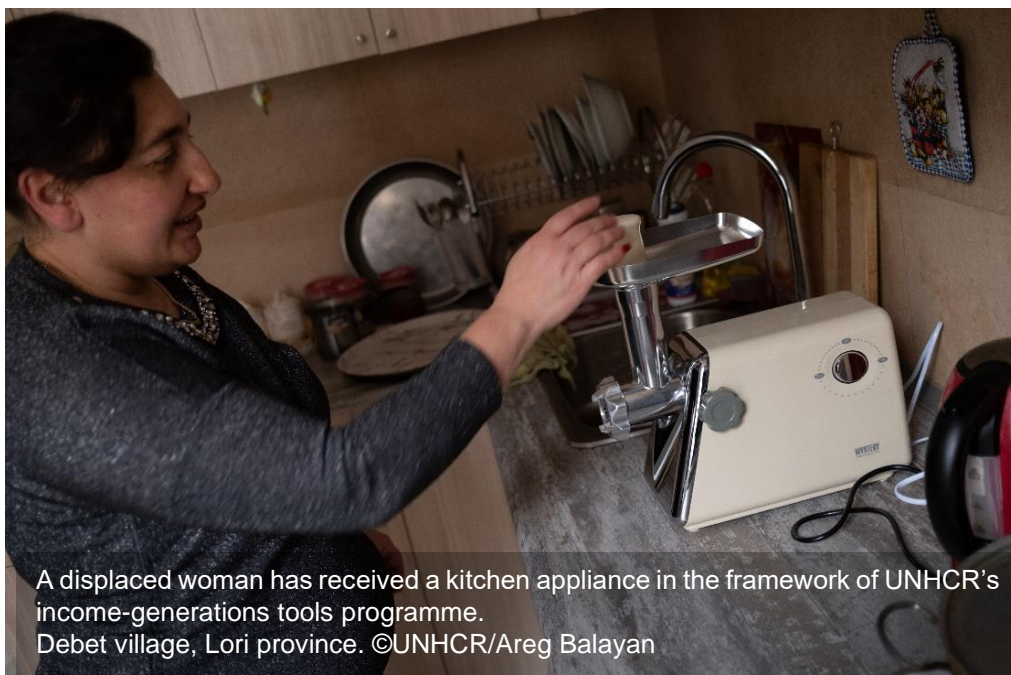
A displaced woman has received a kitchen appliance in the framework of UNHCR's income-generations tools programme. Debet village, Lori province.

To ensure well-being and basic needs of displaced persons, UNHCR continues providing case management and specialized services based on the outcomes of the protection monitoring activities and functioning Hotline. Together with facilitating the access to livelihoods projects, as well as vocational trainings and Armenian language classes, UNHCR continues providing cash-based assistance to the most vulnerable displaced persons. An important activity will also be the capacitation of partner organizations in early identification of child protection needs and victims of GBV and organization of appropriate response.