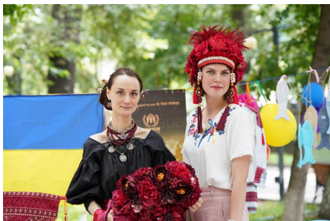
#WorldRefugeeDay commemoration with cross-cultural festivities and handicraft by children

participated in general information and economic integration sessions implemented by UNHCR partner, Armenian Red Cross Society .