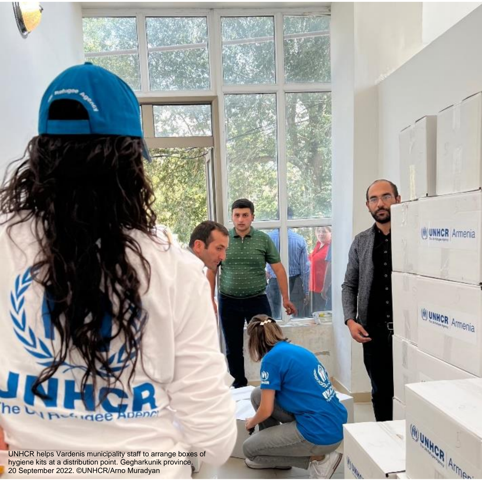
UNHCR helps Vardenis municipality staff to arrange boxes of hygiene kits at a distribution point. Gegharkunik province, 20 September 2022.