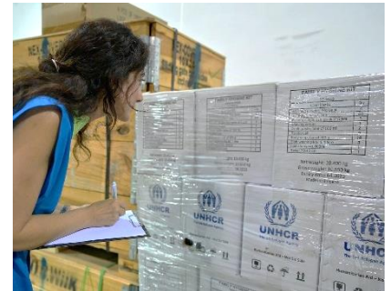
UNHCR staff check items offloaded from the first of 16 trucks to deliver emergency supplies in Armenia

Both emergency and longer-term accommodation is urgently needed. The Government, together with the international and national community, are working to address the most urgent needs, while identifying longer-term response solutions (i.e. housing, livelihoods and education).