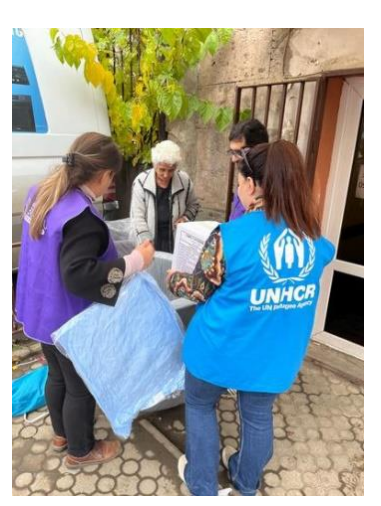
UNHCR and Mission Armenia, distributed household items to refugees in Kapan communities of Syunik province. October 2023