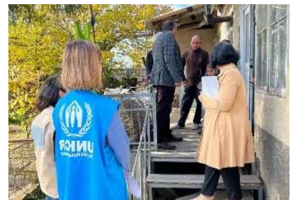
Lori province - UNHCR and authorities jointly carry out house visits to learn about refugees' needs.