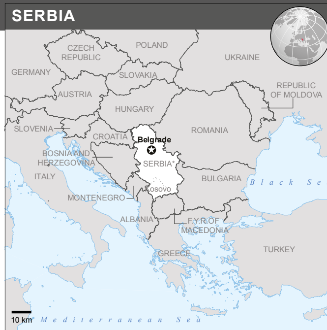
The boundaries and names shown and the designations used on this map do not imply official endorsement or acceptance by the United Nations. *References to Kosovo shall be understood to be in the context of the Security Council resolution 1244(1999). Creation date: 16 Dec 2016.