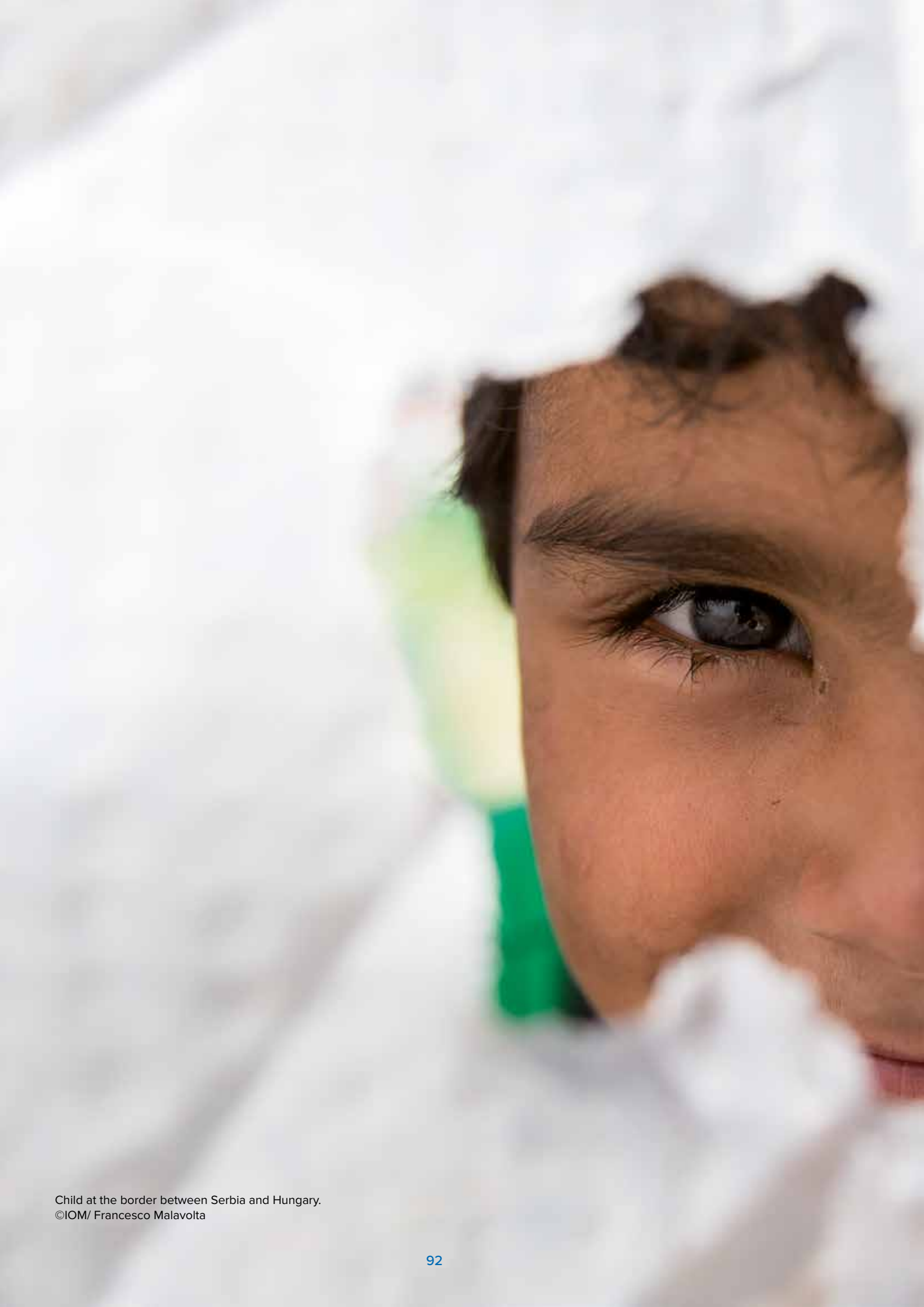
Child at the border between Serbia and Hungary.