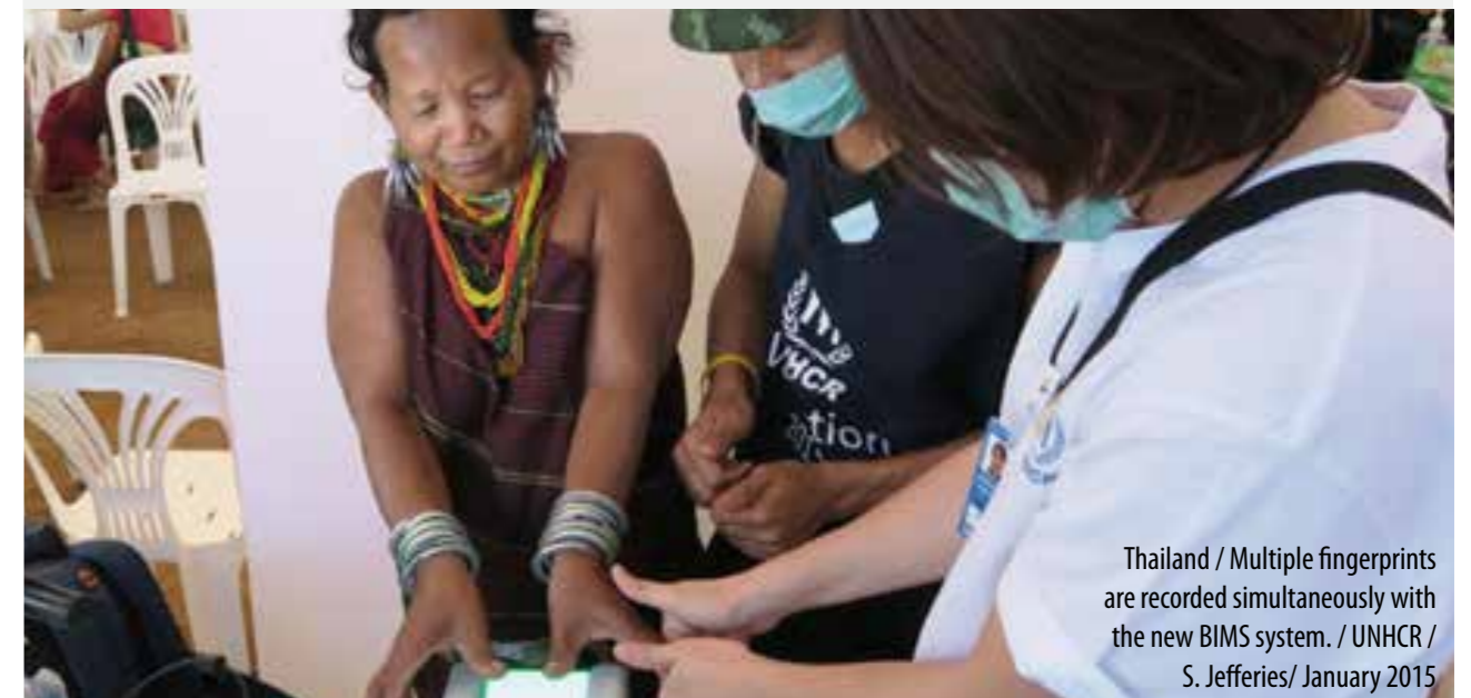
Thailand / Multiple fingerprints are recorded simultaneously with the new BIMS system. / UNHCR / S. Jefferies/ January 2015