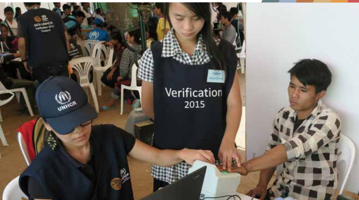
UNHCR Thailand/ Karenni A refugee provides his iris scan and fingerprints as part of a verification exercise jointly conducted by UNHCR and the Royal Thai Government in January 2015 regarding the identities of 120,000 persons of concern in Western Thailand.

Through its Key Initiatives series, UNHCR's Division of Programme Support and Management (DPSM) shares regular updates on interesting projects that produce key tools, practical guidance and new approaches aimed at moving UNHCR operations forward.