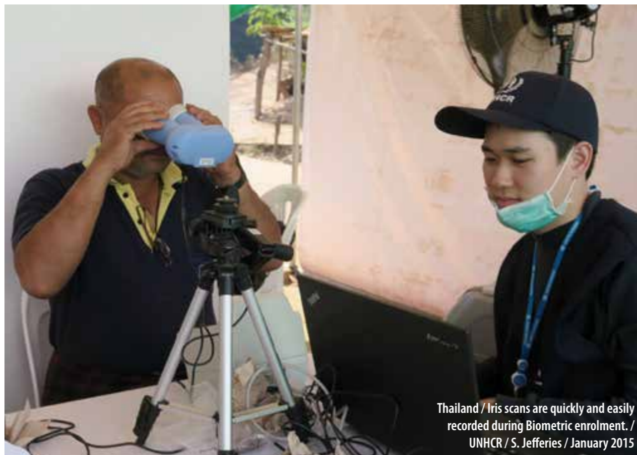
Thailand / Iris scans are quickly and easily recorded during Biometric enrolment. / UNHCR / S. Jefferies / January 2015

Identifying a person using BIMS is quick and simple. After enrolment, refugees and others of concern need only to present two or more biometric elements (e.g., two fingers, two eyes, or a combination thereof) for BIMS to be able to ascertain their identity within seconds. The matching time for identity checks during the roll out in Thailand was on average five seconds.