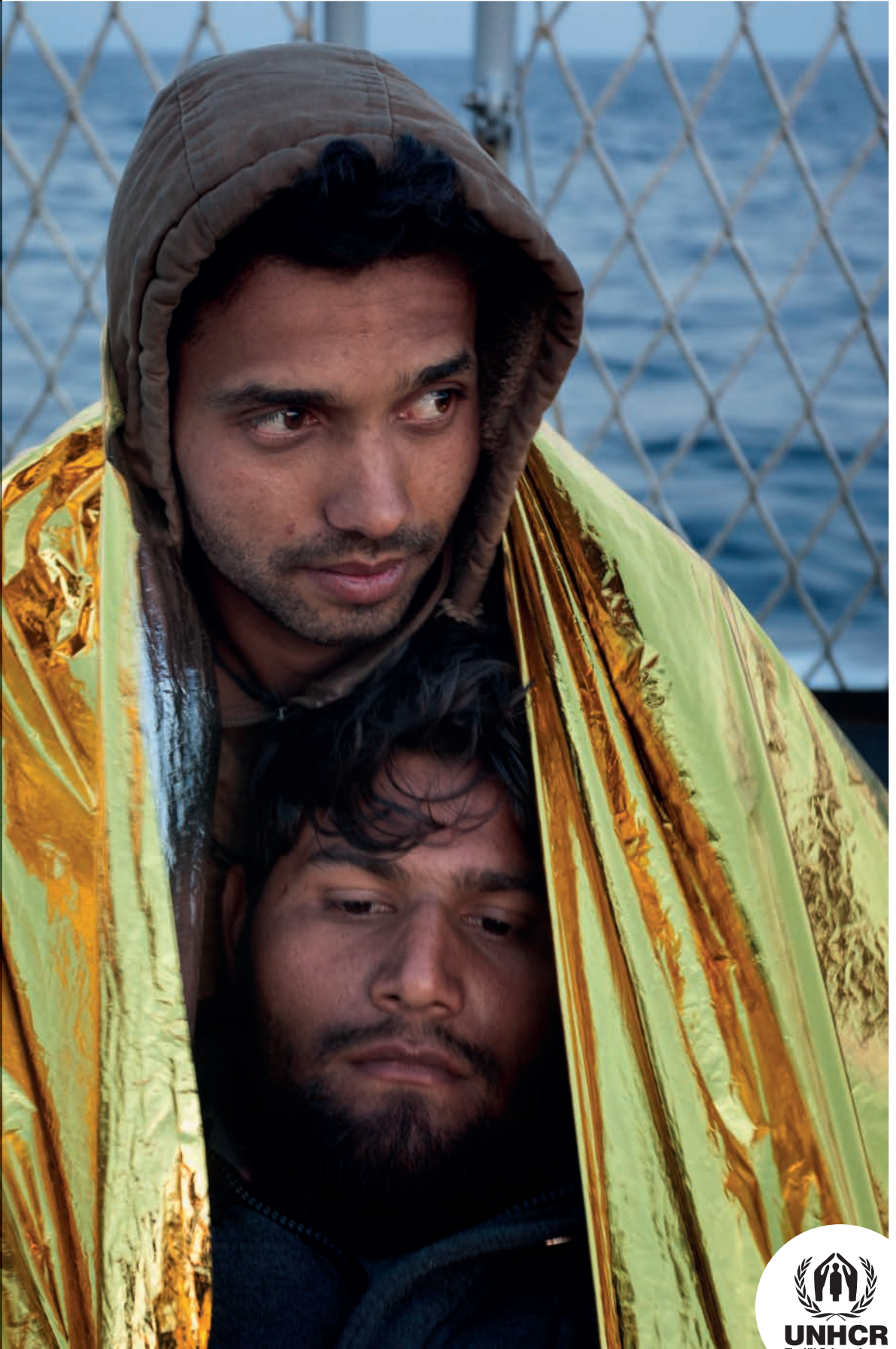
Two asylum-seekers rescued by the Italian navy on the Mediterranean share a thermal blanket.