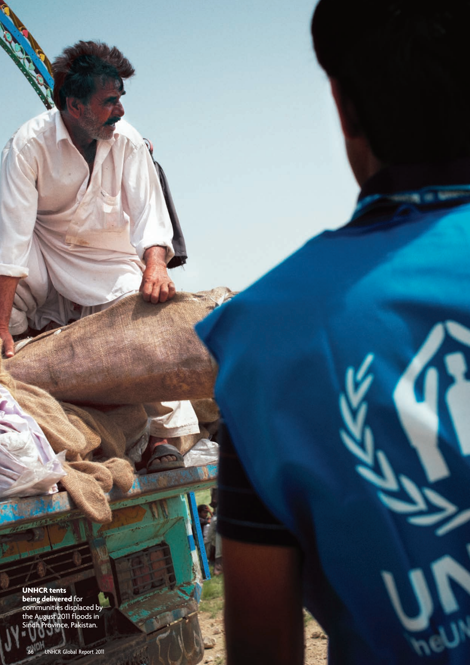
UNHCR tents being delivered for communities displaced by the August 2011 floods in Sindh Province, Pakistan.