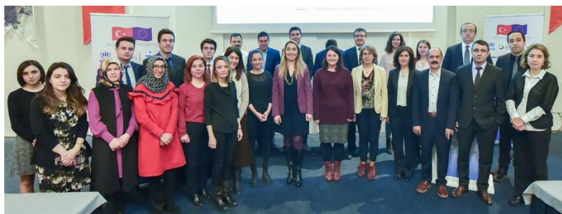
İSKUR officials received “Strengthening Public Employment Services” training in Ankara.

A three-day training for 26 Turkish employment agency (İŞKUR) Directorate General staff took place in Ankara to further refugee inclusion into the labour markets. The training topics focused on the applicable legal framework and available public services, UNHCR’s mandate, and its livelihoods programming.