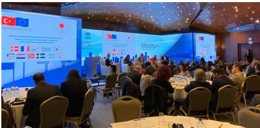
Participants come together in the Istanbul Municipal Coordination and Social Cohesion meeting (page 4) under the theme “Cities Empowered with Refugees” to discuss potential support and coordination mechanisms in the Marmara Region.

UNHCR organized a field visit to Istanbul with donors PRM, DFID, Canada, Ireland, Switzerland, the Netherlands, Germany, Norway, and Denmark. The donors were briefed by the Istanbul team, and visited a Social Service Centre, a Social Protection Desk (run by UNHCR partner WALD), and the child protection efforts of Mavi Kalem. Donors had the opportunity to interact with refugees in a roundtable discussion. Furthermore, in South East Turkey, UNHCR met with the Ambassador of the Republic of South Korea and representatives of the Korean Embassy in Ankara to share updates on the refugee operation in the South East. Also in November, UNHCR briefed representatives of the embassies of the Netherlands and New Zealand on the refugee situation in South East Turkey.