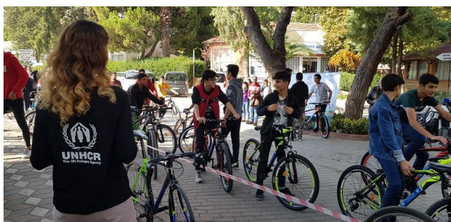
Cycling event in Manisa, Izmir where refugee youth cycled alongside experienced cyclists.

On 6 November, UNHCR and WALD organized the third Municipal Coordination and Social Cohesion meeting in Istanbul under the theme, "Cities Empowered with Refugees". Around 100 representatives of metropolitan and district municipalities of the Marmara Region and international organizations attended the event which explored technical and potential financial support and coordination mechanisms. In his opening remarks, UNHCR's Deputy Representative emphasised the multi-stakeholder approach of the Global Compact on Refugees and welcomed the endorsement of the Declaration of Municipal Coordination Platform within the Context of Refugees, encouraging other municipalities to join.