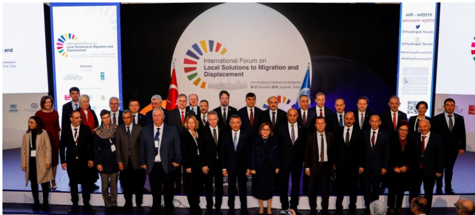
Notable officials, mayors and development actors gather at the International Municipal Forum in Gaziantep.

The International Forum on Local Solutions to Migration and Displacement (the Municipal Forum ) ‘From Emergency to Resilience and Development’, took place on 26-27 November in Gaziantep and was co-organized by the Gaziantep Metropolitan Municipality, UNDP, UNHCR, IOM, the World Academy For Local Government and Democracy (WALD), the Union of Municipalities of Turkey, and the United Cities and Local Governments Middle East and West Asia Section (UCLG-MEWA). The Forum brought together mayors and local development actors from various countries to share good practices and facilitate city-level partnerships. The Municipal Forum contributed to existing networks of relevant actors in migration and forced displacement contexts. It also highlighted approaches in light of the Global Compact on Refugees (GCR) and the Global Compact on Safe, Orderly and Regular Migration (GCM). A key outcome of the Municipal Forum was the Gaziantep Declaration reflecting good practices on local solutions to migration and forced displacement. The Gaziantep Declaration was signed by 37 stakeholders including mayors and representatives of local development actors, civil society and UN agencies.