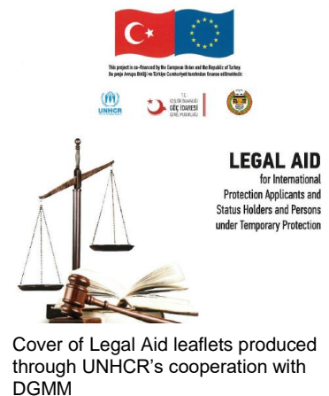
Cover of Legal Aid leaflets produced through UNHCR’s cooperation with DGMM

A workshop on Country of Origin Information (COI) and its latest developments took place in Ankara on 26 November with the participation of 16 DGMM/PDMM personnel. UNHCR and DGMM discussed the COI Method Guide jointly drafted by a technical team from DGMM and UNHCR and shared findings of COI-related study visits to Germany and Belgium. Discussions also covered principles and standards when using COI, as well as current practices and opportunities for further improvement.