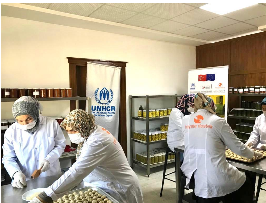
Turkish and Syrian women in Hatay produce local food through a vocational training initiative with UNHCR partner STL

As of end July 2020, UNHCR provided 4,681 resettlement submissions (3,859 Syrians and 822 refugees of other nationalities) to 14 countries; and 2,062 refugees (1,534 Syrian and 528 of other nationalities) departed for resettlement to 12 countries. Some 1,406 refugees were referred to UNHCR for resettlement consideration in July.