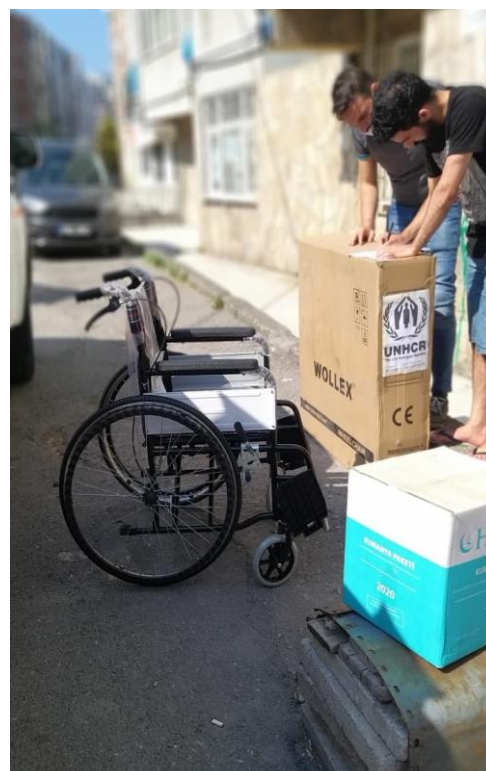
Wheelchairs are distributed across areas in the Anatolian region

By the end of July, UNHCR support to refugee initiatives for the production of soap bars and face masks in the Anatolian region had come to a close, however, many continued in cooperation with the local authorities and partners. UNHCR has directly supported 12 initiatives of refugees to produce soap bars and masks as well as protective shields for their communities, bringing together some refugees and Turkish citizens in a safe manner.